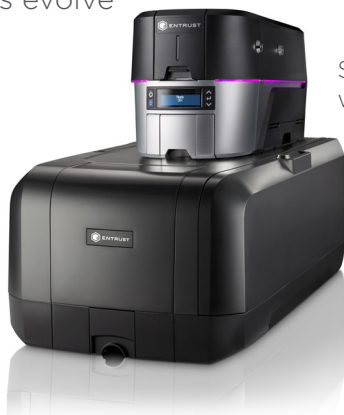
Single-hopper with embosser