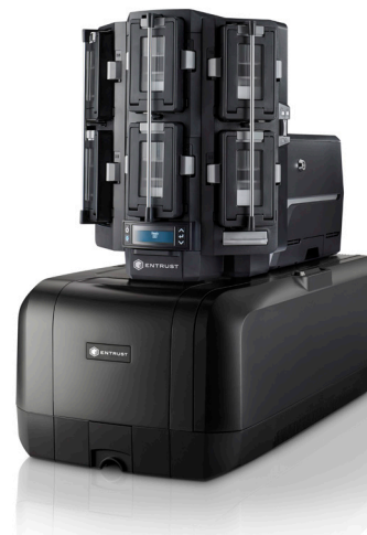
Multi-hopper with embosser

Supply yields: Panel ribbon yields stated are typically the maximum number of panel sets per roll. Monochrome ribbon yields stated as average printing of 2,500 images simplex. Actual yields may vary. Topping foil yield is typically the maximum achievable per roll. Indent ribbon yield varies depending on character size and number of characters printed per card.