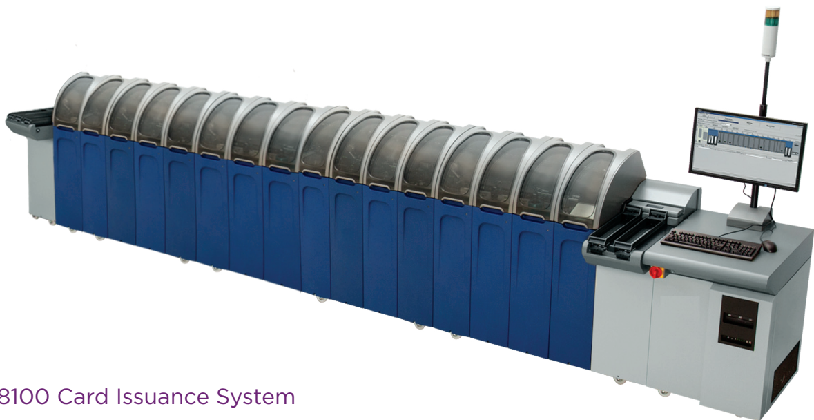
MX8100 Card Issuance System

Service and support: The MX Series Platform is supported by the industry's largest service and support network, which spans more than 150 countries worldwide. Online and phone support is available 24/7.