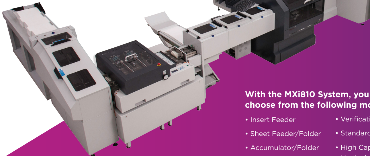
MXi810 Envelope Insertion System