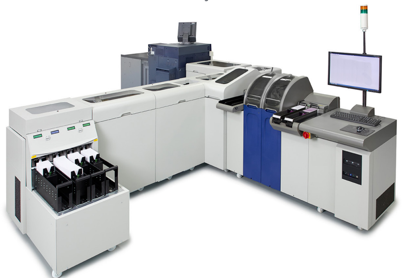
MXD811 Card Delivery System

Support market trends: Meet the growing vertical card trend without limiting job sizes based on card orientation. Dynamically place cards on carriers horizontally and vertically to meet customer requests.