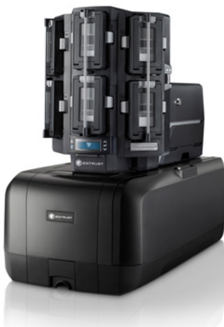
Multi-hopper with embosser