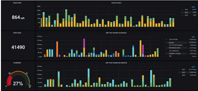
Idle time panel