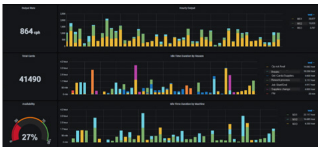
Idle time panel