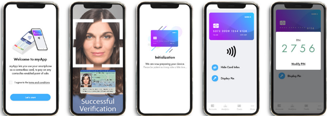
Welcome and Initialization